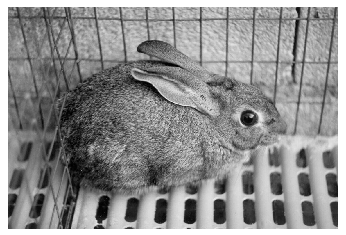
Figure 1. Cage floor in whose orifices the hind limbs of wild rabbits became trapped.

dislocations, and skin erosions with hemorrhage. Seven (58.3%) of the kits suffering accidents to the limbs died as a result of the trauma.